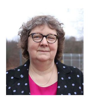
KEYNOTE: Digital Accessibility and a Global Inclusive Education Standard